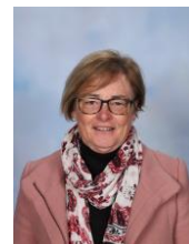
Coral Maxwell College Council member